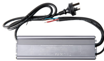
FLS-D-200W & FLS-D-250W